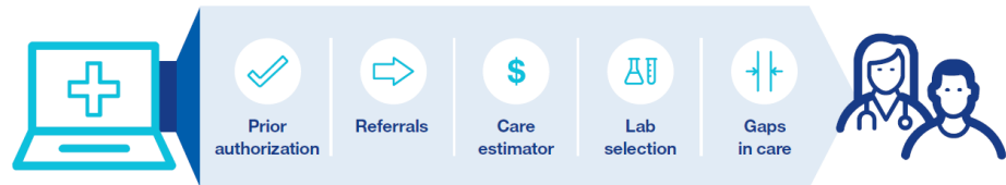
Figure 2. Point of Care Assist™. Our innovative tool integrates health records from multiple sources into one platform, giving providers a comprehensive and real-time view into their patient's health care needs.

These HIT solutions enable providers to have a fuller and more direct line of sight into their patient's current and recent health and wellness status, other